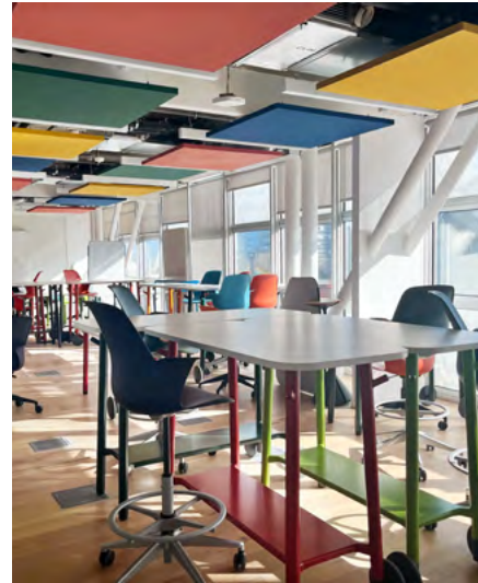
← ↓ Nancy Artem Campus