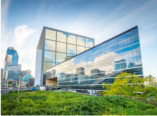
↓ → Paris La Défense Campus